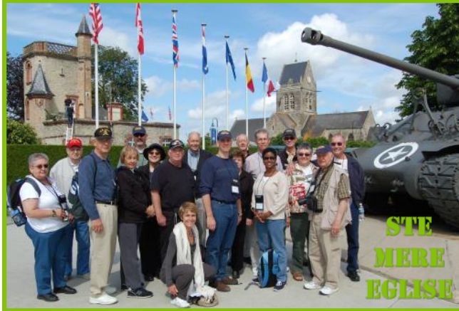
STE MERE EGLISE

CONTINUED FOR 2024! MHT has expanding our traditional D-Day tour to include the World War II Battle of the Bulge in Belgium. Of all the battles fought by United States in Europe during WWII, these two are considered the most significant. Since the world was commemorating the 100th anniversary of World War I, we also will take a look into America's involvement in this "war to end all wars." A case can be made that WWI and